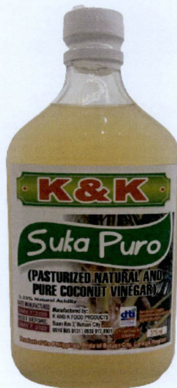
Figure 1. Unregistered K & K Suka Puro (Pasturized Natural and Pure Coconut Vinegar)

The Food and Drug Administration (FDA) warns all healthcare professionals and the general public NOT TO PURCHASE AND CONSUME the unregistered food product: