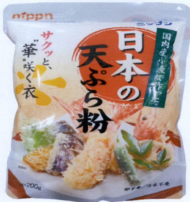
Figure 1. Unregistered NIPPN Japanese Tempura Batter Mix

The Food and Drug Administration (FDA) warns all healthcare professionals and the general public NOT TO PURCHASE AND CONSUME the unregistered food product: