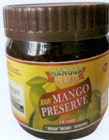
Figure 1. Unregistered MANGGA FIESTA Raw Mango Preserve 3 in 1 Flavor

The Food and Drug Administration (FDA) warns all healthcare professionals and the general public NOT TO PURCHASE AND CONSUME the unregistered food product: