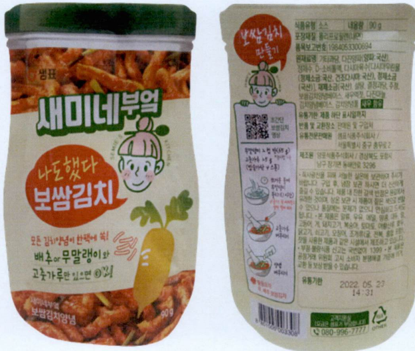
Figure 1. Unregistered Food Product in Sealed Packaging with Green Label and Image of Girl (In Foreign Language)

The Food and Drug Administration (FDA) warns all healthcare professionals and the general public NOT TO PURCHASE AND CONSUME the unregistered food product: