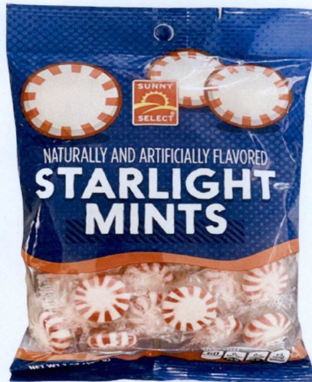
Figure 1. Unregistered SUNNY SELECT Naturally and Artificially Flavored Starlight Mints

The Food and Drug Administration (FDA) warns all healthcare professionals and the general public NOT TO PURCHASE AND CONSUME the unregistered food product: