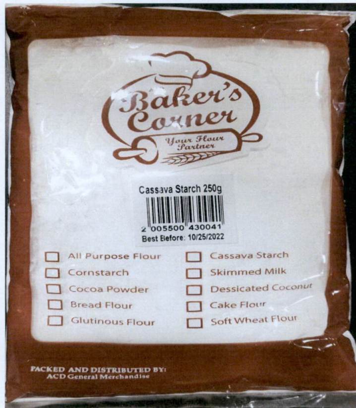
Figure 1. Unregistered BAKER'S CORNER Cassava Starch

The Food and Drug Administration (FDA) warns all healthcare professionals and the general public NOT TO PURCHASE AND CONSUME the unregistered food product: