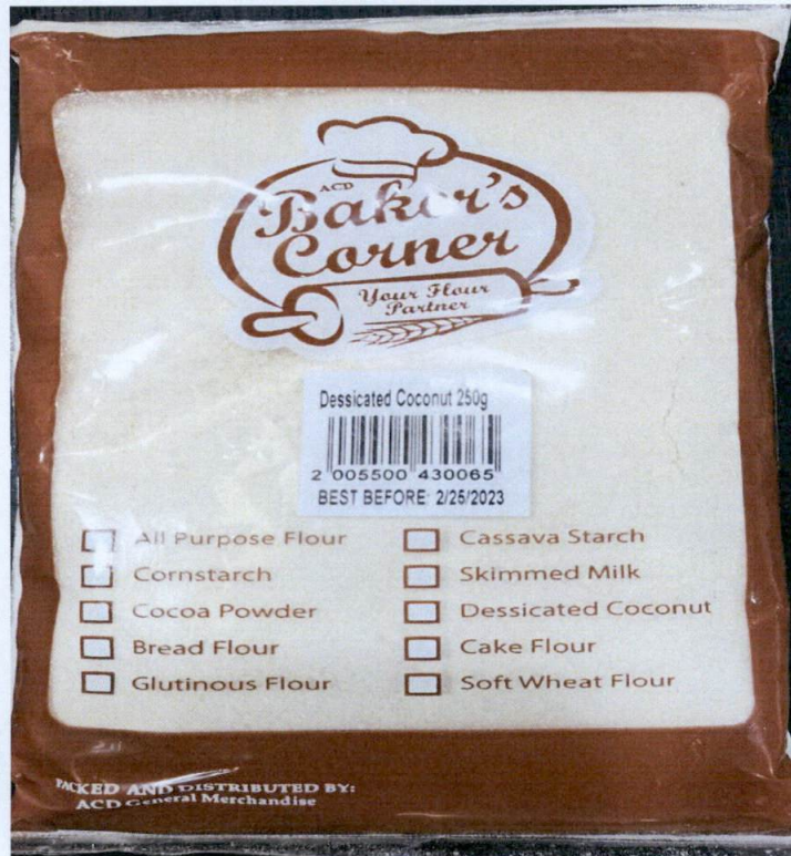
Figure 1. Unregistered BAKER'S CORNER Dessicated Coconut

The Food and Drug Administration (FDA) warns all healthcare professionals and the general public NOT TO PURCHASE AND CONSUME the unregistered food product: