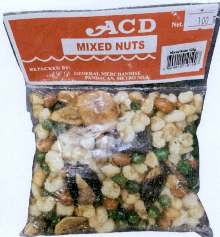
Figure 1. Unregistered ACD Mixed Nuts

The Food and Drug Administration (FDA) warns all healthcare professionals and the general public NOT TO PURCHASE AND CONSUME the unregistered food product: