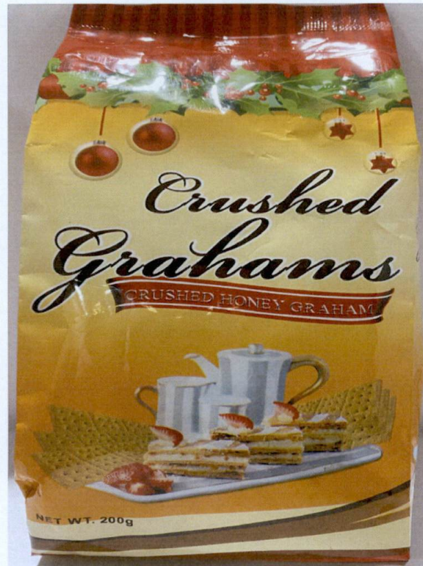
Figure 1. Unregistered CRUSHED GRAHAMS Crushed Honey Graham

The Food and Drug Administration (FDA) warns all healthcare professionals and the general public NOT TO PURCHASE AND CONSUME the unregistered food product: