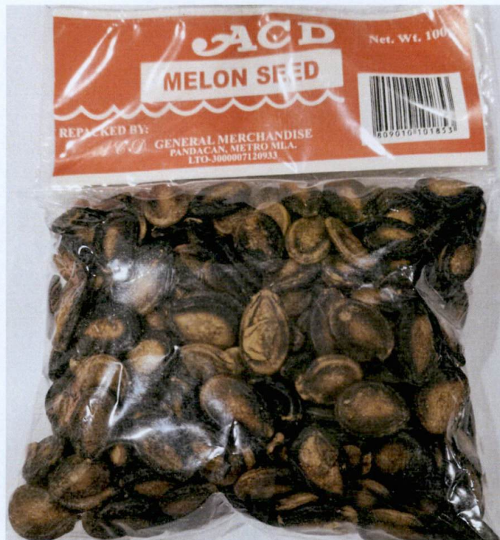
Figure 1. Unregistered ACD Melon Seed

The Food and Drug Administration (FDA) warns all healthcare professionals and the general public NOT TO PURCHASE AND CONSUME the unregistered food product: