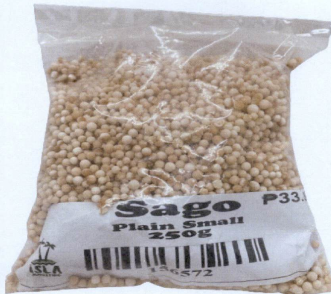
Figure 1. Unregistered ISLA MARKETING Sago Plain Small

The Food and Drug Administration (FDA) warns all healthcare professionals and the general public NOT TO PURCHASE AND CONSUME the unregistered food product: