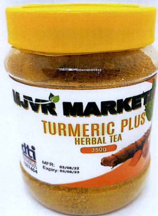
Figure 1. Unregistered MJVR MARKETING Turmeric Plus Herbal Tea

The Food and Drug Administration (FDA) warns all healthcare professionals and the general public NOT TO PURCHASE AND CONSUME the unregistered food product: