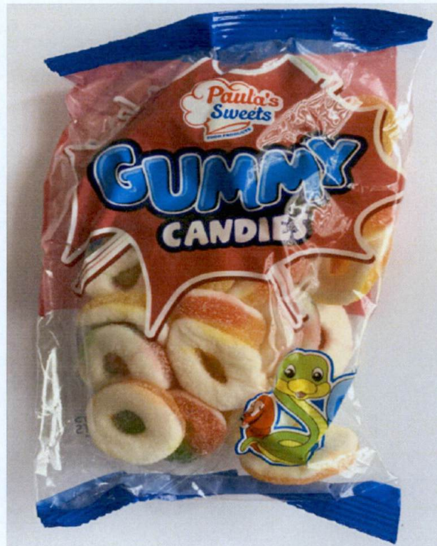
Figure 1. Unregistered PAULA'S SWEETS FOOD PRODUCTS Gummy Candies

The Food and Drug Administration (FDA) warns all healthcare professionals and the general public NOT TO PURCHASE AND CONSUME the unregistered food product: