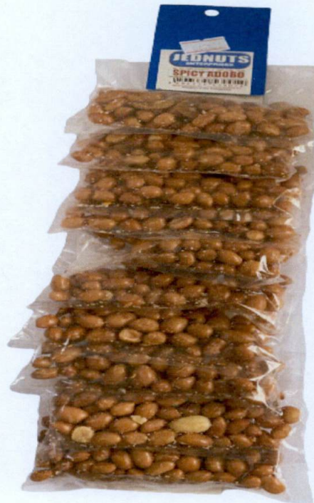
Figure 1. Unregistered JEDNUTS ENTERPRISES Spicy Adobo

The Food and Drug Administration (FDA) warns all healthcare professionals and the general public NOT TO PURCHASE AND CONSUME the unregistered food product: