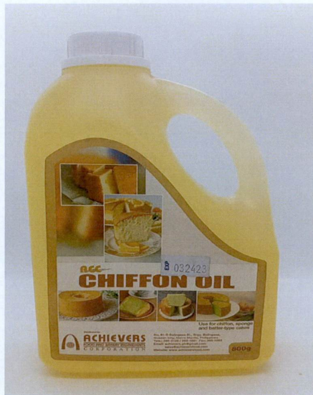
Figure 1. Unregistered ACC Chiffon Oil

The Food and Drug Administration (FDA) warns all healthcare professionals and the general public NOT TO PURCHASE AND CONSUME the unregistered food product: