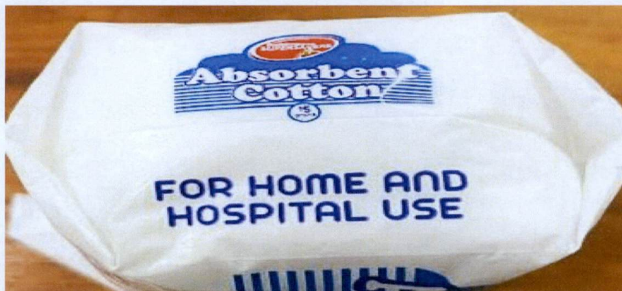
Figure 1. Robinsons Supersavers Absorbent Cotton with Expired Certificate of Product Registration