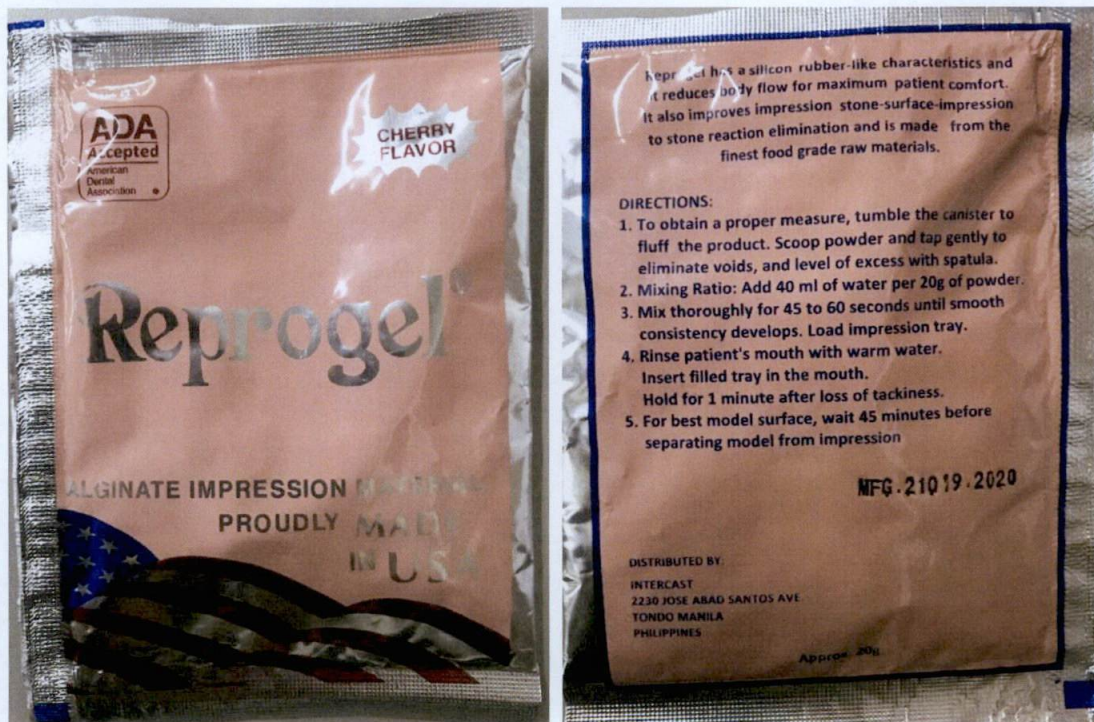
Figure 1. Unnotified Reprogel® ALLGINATE IMPRESSION MATERIAL – CHERRY FLAVOR

The Food and Drug Administration (FDA) warns all healthcare professionals and the general public NOT TO PURCHASE AND USE the unnotified medical device product: