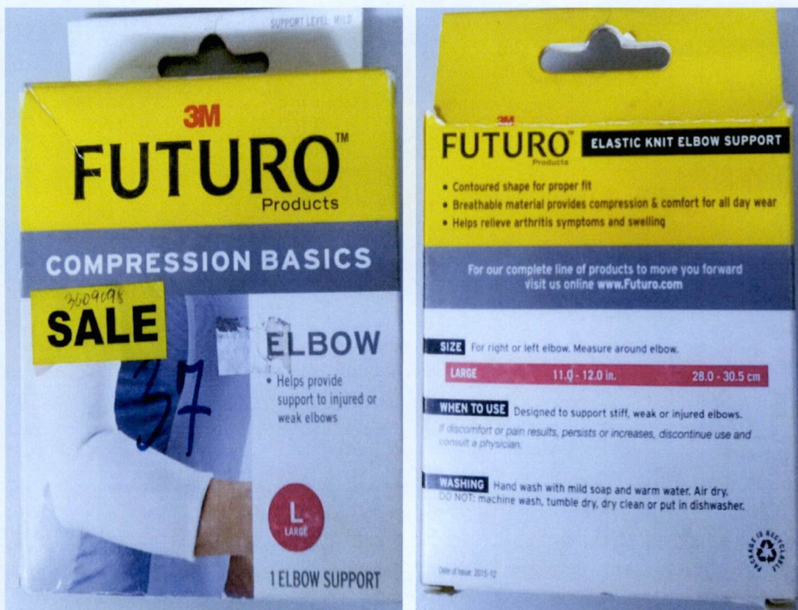
Figure 1. Unnotified 3M Futuro Compression Basics

The Food and Drug Administration (FDA) warns all healthcare professionals and the general public NOT TO PURCHASE AND USE the unnotified medical device products: