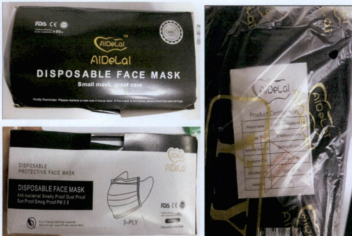
Figure 1. Unnotified AiDeLai Face Mask (Black)

The Food and Drug Administration (FDA) warns all healthcare professionals and the general public NOT TO PURCHASE AND USE the unnotified medical device product: