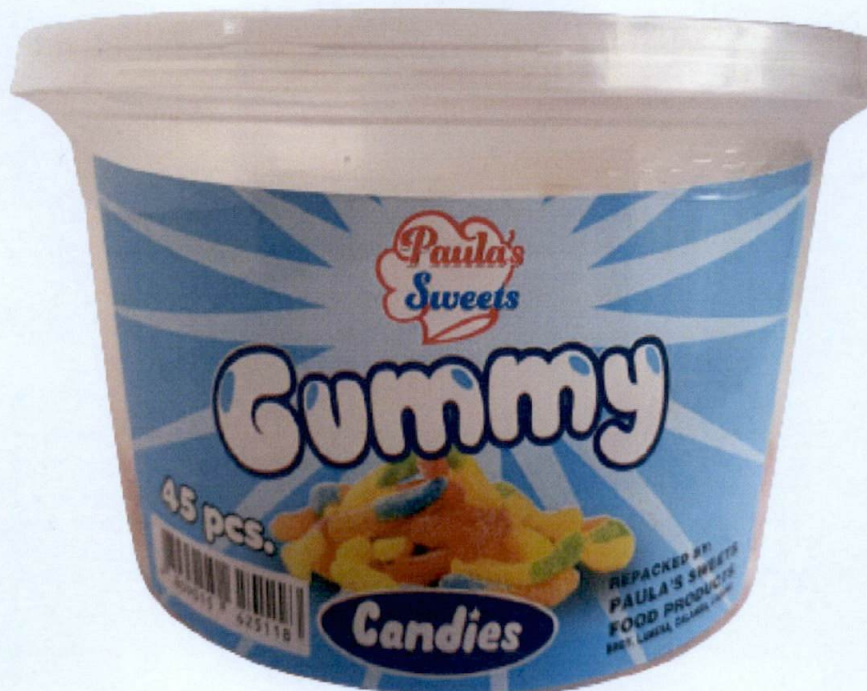
Figure 1. Unregistered PAULA'S SWEETS Gummy Candies

The Food and Drug Administration (FDA) warns all healthcare professionals and the general public NOT TO PURCHASE AND CONSUME the unregistered food product: