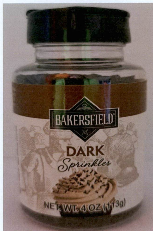
Figure 1. Unregistered BAKERSFIELD Dark Sprinkles

The Food and Drug Administration (FDA) warns all healthcare professionals and the general public NOT TO PURCHASE AND CONSUME the unregistered food product: