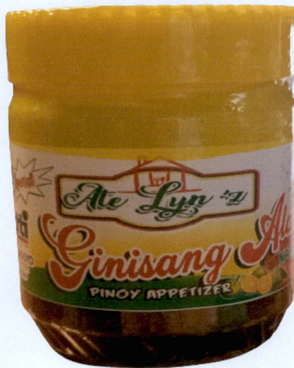
Figure 1. Unregistered ATE LYN'S Special Ginisang Alamang Natural Pinoy Appetizer

The Food and Drug Administration (FDA) warns all healthcare professionals and the general public NOT TO PURCHASE AND CONSUME the unregistered food product: