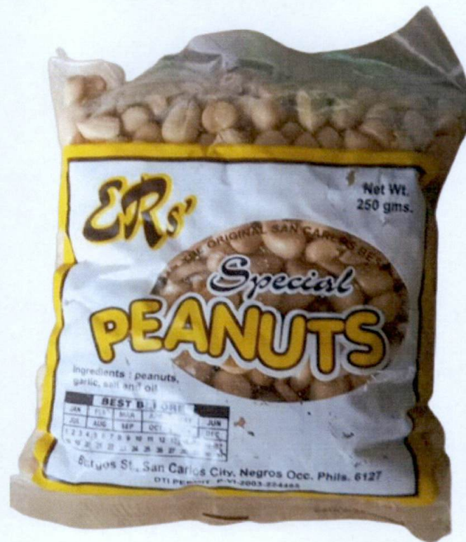
Figure 1. Unregistered ER'S The Original San Carlos Best Special Peanuts

The Food and Drug Administration (FDA) warns all healthcare professionals and the general public NOT TO PURCHASE AND CONSUME the unregistered food product: