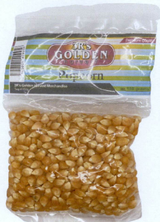
Figure 1. Unregistered 3R's GOLDEN HARVEST Popcorn

The Food and Drug Administration (FDA) warns all healthcare professionals and the general public NOT TO PURCHASE AND CONSUME the unregistered food product: