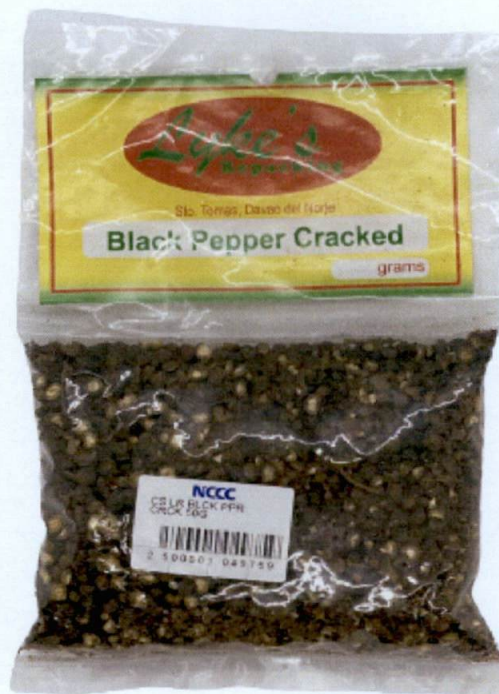
Figure 1. Unregistered LYKE'S REPACKING Black Pepper Cracked

The Food and Drug Administration (FDA) warns all healthcare professionals and the general public NOT TO PURCHASE AND CONSUME the unregistered food product: