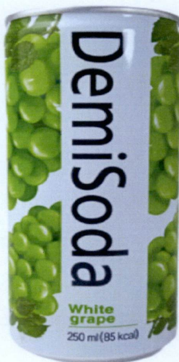
Figure 1. Unregistered DEMISODA White Grape

The Food and Drug Administration (FDA) warns all healthcare professionals and the general public NOT TO PURCHASE AND CONSUME the unregistered food product: