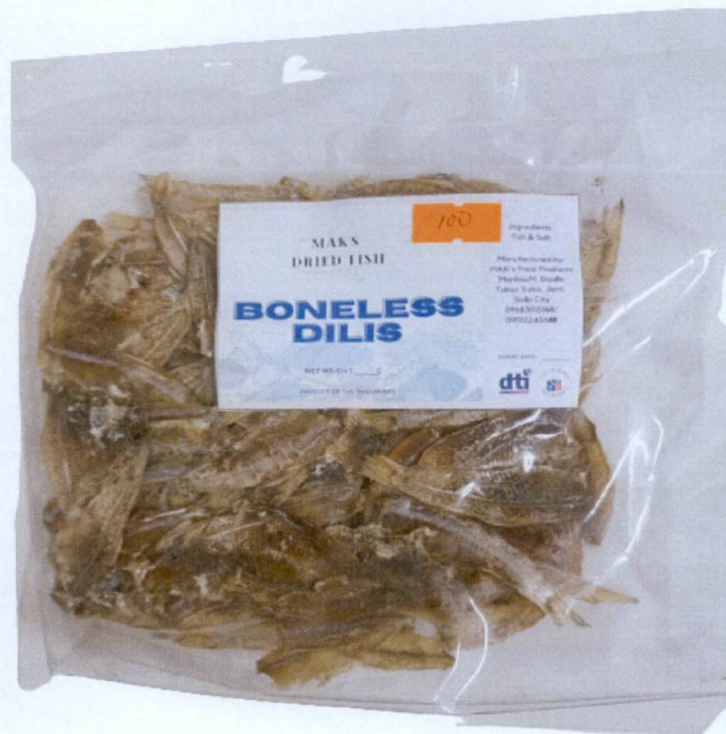
Figure 1. Unregistered MAK'S DRIED FISH Boneless Dilis

The Food and Drug Administration (FDA) warns all healthcare professionals and the general public NOT TO PURCHASE AND CONSUME the unregistered food product: