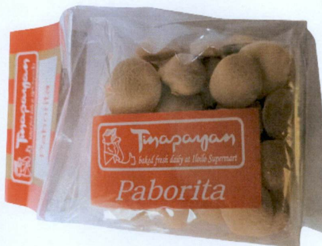
Figure 1. Unregistered TINAPAYAN Paborita

The Food and Drug Administration (FDA) warns all healthcare professionals and the general public NOT TO PURCHASE AND CONSUME the unregistered food product: