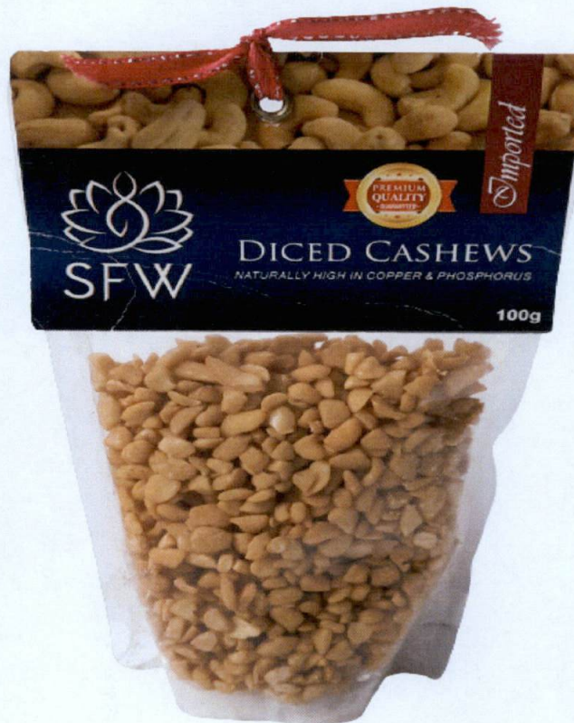
Figure 1. Unregistered SFW Diced Cashews

The Food and Drug Administration (FDA) warns all healthcare professionals and the general public NOT TO PURCHASE AND CONSUME the unregistered food product: