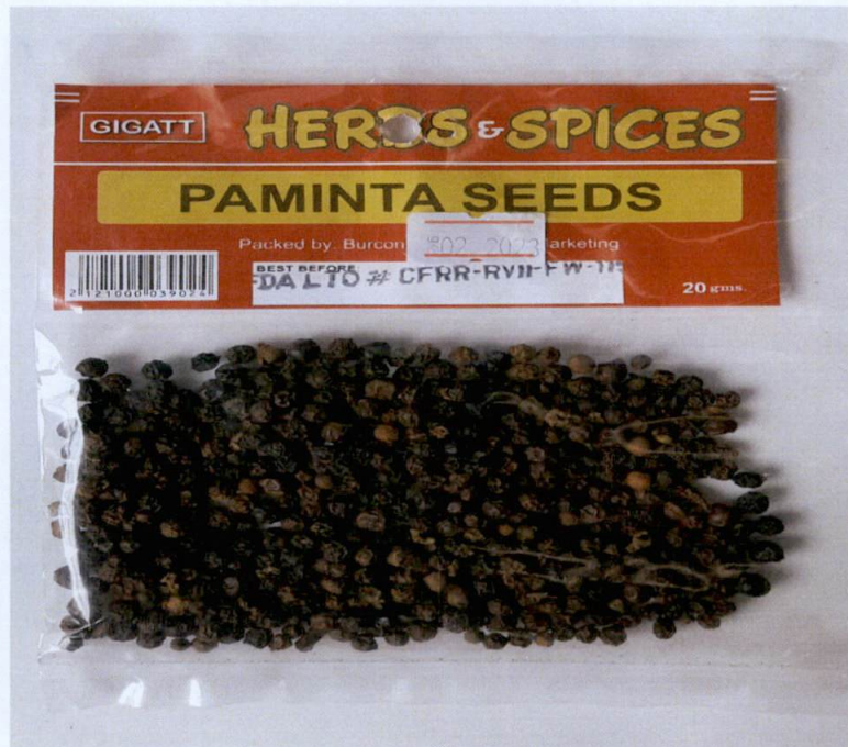
Figure 1. Unregistered GIGATT HERBS & SPICES Paminta Seeds

The Food and Drug Administration (FDA) warns all healthcare professionals and the general public NOT TO PURCHASE AND CONSUME the unregistered food product: