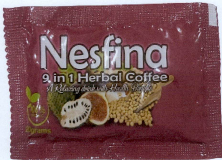
Figure 1. Unregistered NESFINA 9 in 1 Herbal Coffee

The Food and Drug Administration (FDA) warns all healthcare professionals and the general public NOT TO PURCHASE AND CONSUME the unregistered food product: