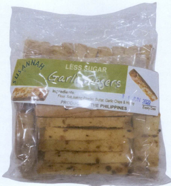
Figure 1. Unregistered SUSANNAH Garlic Fingers Less Sugar

The Food and Drug Administration (FDA) warns all healthcare professionals and the general public NOT TO PURCHASE AND CONSUME the unregistered food product: