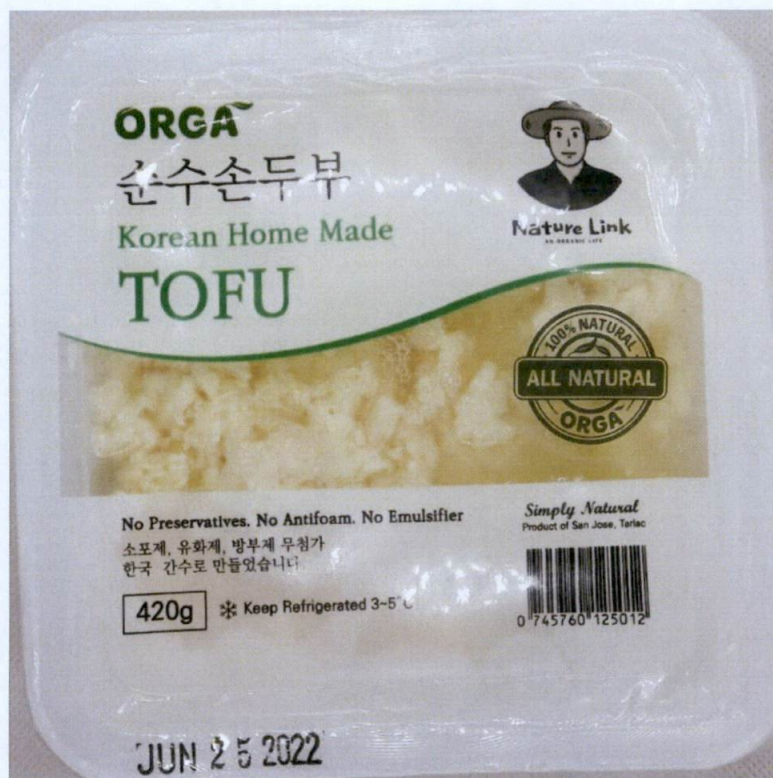
Figure 1. Unregistered NATURE LINK ORGA Korean Home Made Tofu

The Food and Drug Administration (FDA) warns all healthcare professionals and the general public NOT TO PURCHASE AND CONSUME the unregistered food product: