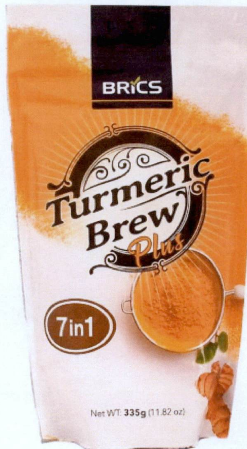
Figure 1. Approved label of BRICS 7 in 1 Turmeric Brew Plus, FR-4000005727944 issued on 24 March 2020 valid until 24 March 2025 .

The Food and Drug Administration (FDA) informs the public that the food product BRICS 7 in 1 Turmeric Brew Plus has been registered by the Market Authorization Holder (MAH) Brics Ventures in accordance to existing FDA rules and regulations.