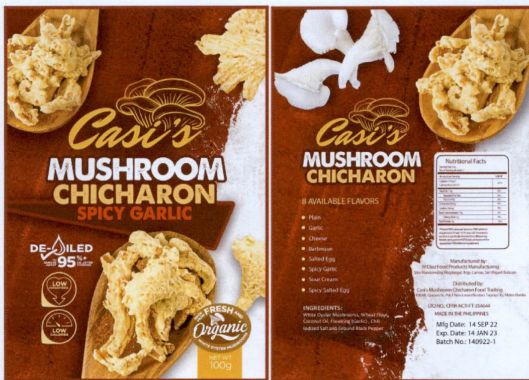
Figure 1. The approved label of CASIS'S Mushroom Chicharon Spicy Garlic with registration number FR- 4000010176988 issued on 09 November 2022 valid until 09 November 2024 .

The Food and Drug Administration (FDA) informs the public that the following food products are now registered by the Market Authorization Holder (MAH) CASI'S MUSHROOM CHICHARON FOOD TRADING in accordance to existing FDA rules and regulations.