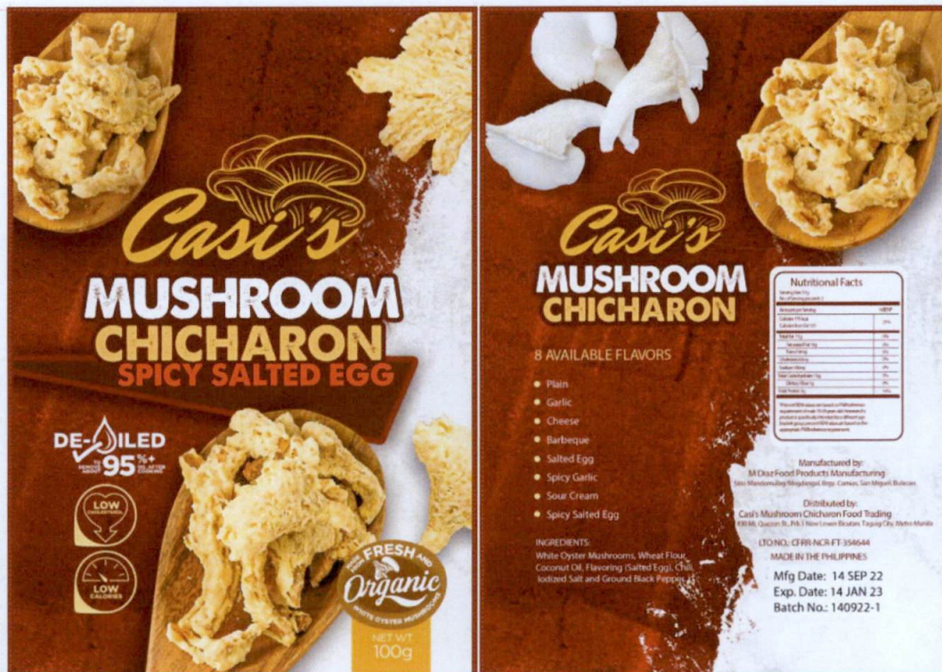
Figure 2. The approved label of CASI'S Mushroom Chicharon Spicy Salted Egg with registration number FR- 4000010177763 issued on 04 November 2022 valid until 04 November 2024 .