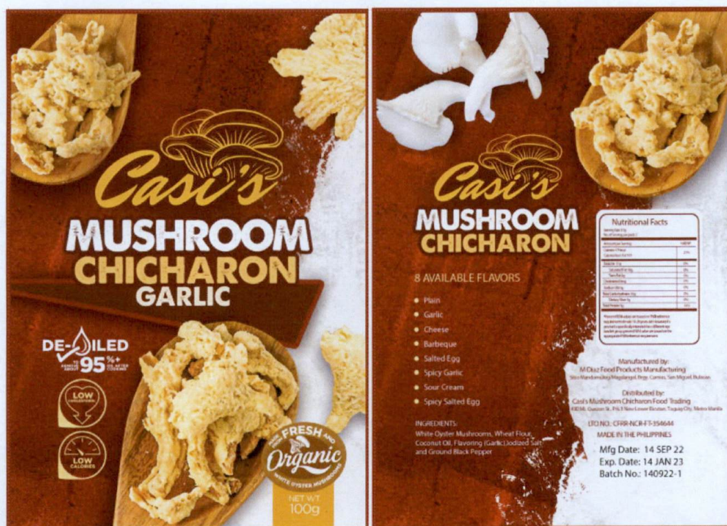
Figure 4. The approved label of CASIS'S Mushroom Chicharon Garlic with registration number FR- 4000010176702 issued on 04 November 2022 valid until 04 November 2024 .

Accordingly, the list released in FDA Advisory No. 2022-1570 is hereby updated to remove the aforementioned food products.