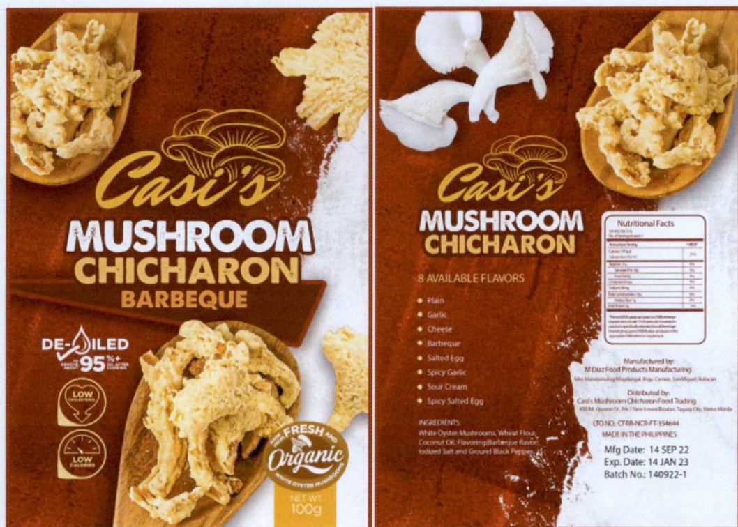
Figure 3. The approved label of CASI'S Mushroom Chicharon Barbeque with registration number FR- 4000010176395 issued on 16 November 2022 valid until 16 November 2024 .