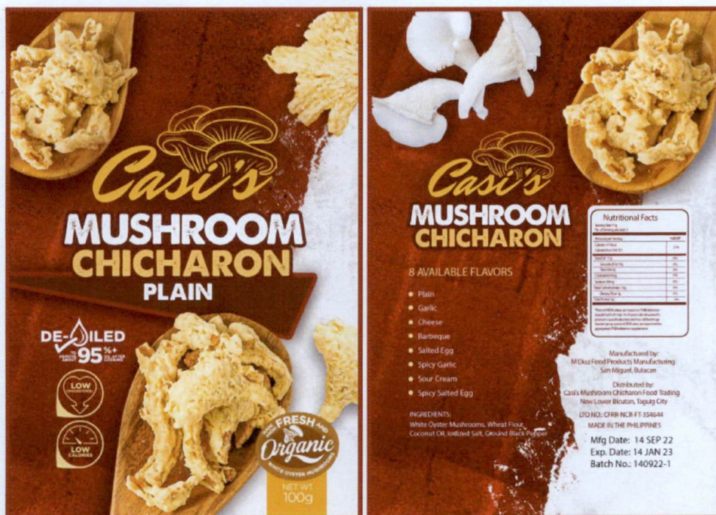
Figure 2. The approved label of CASIS'S Mushroom Chicharon Plain with registration number FR- 4000010176988 issued on 04 November 2022 valid until 04 November 2024 .

Accordingly, the list released in FDA Advisory No. 2022-1574 is hereby updated to remove the aforementioned food products.