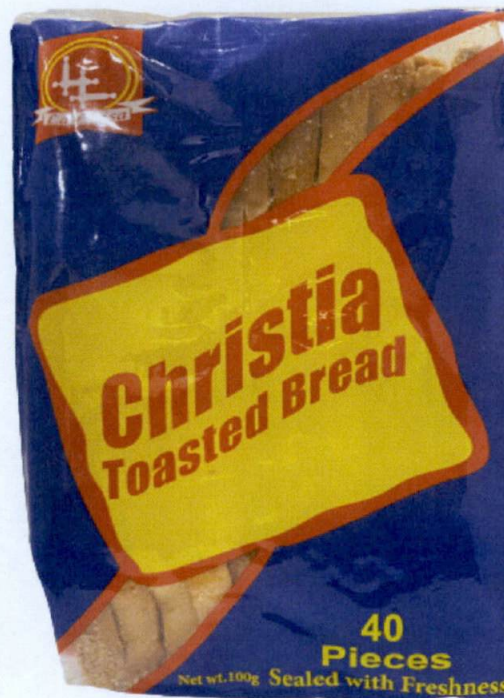
Figure 1. Unregistered LA LUISA Christia Toasted Bread

The Food and Drug Administration (FDA) warns all healthcare professionals and the general public NOT TO PURCHASE AND CONSUME the unregistered food product: