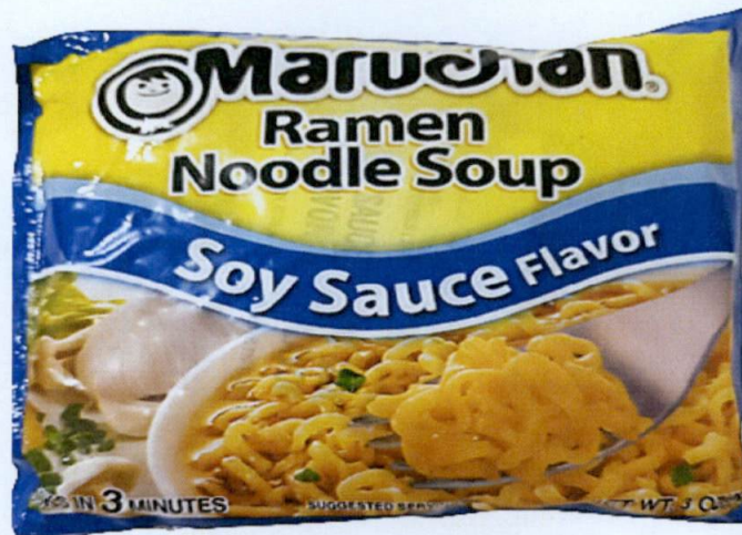
Figure 1. Unregistered MARUCHAN Ramen Noodle Soup - Soy Sauce Flavor

The Food and Drug Administration (FDA) warns all healthcare professionals and the general public NOT TO PURCHASE AND CONSUME the unregistered food product: