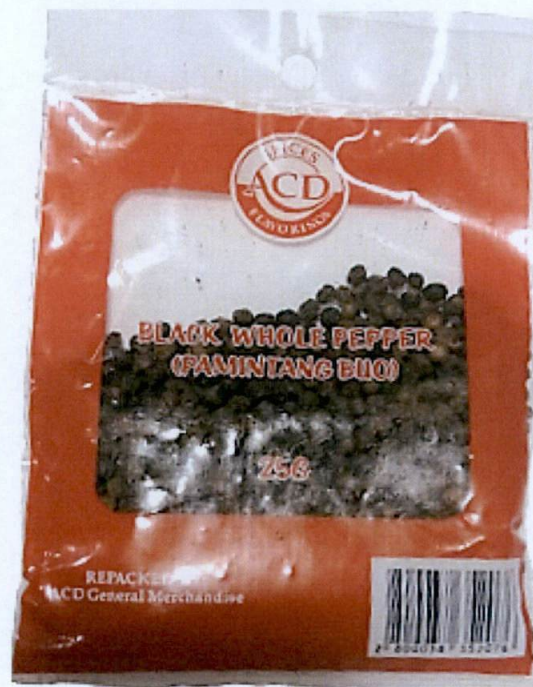
Figure 1. Unregistered SPICES ACD FLAVORINGS Black Whole Pepper (Pamintang Buo)

The Food and Drug Administration (FDA) warns all healthcare professionals and the general public NOT TO PURCHASE AND CONSUME the unregistered food product: