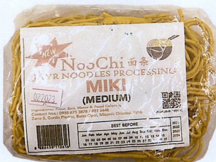
Figure 1. Unregistered NOOCHI JAYR NOODLES PROCESSING Miki (Medium)

The Food and Drug Administration (FDA) warns all healthcare professionals and the general public NOT TO PURCHASE AND CONSUME the unregistered food product: