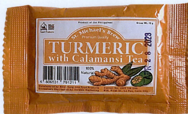
Figure 1. Unregistered ST. MICHAEL'S BREW Premium Quality Turmeric with Calamansi Tea

The Food and Drug Administration (FDA) warns all healthcare professionals and the general public NOT TO PURCHASE AND CONSUME the unregistered food product: