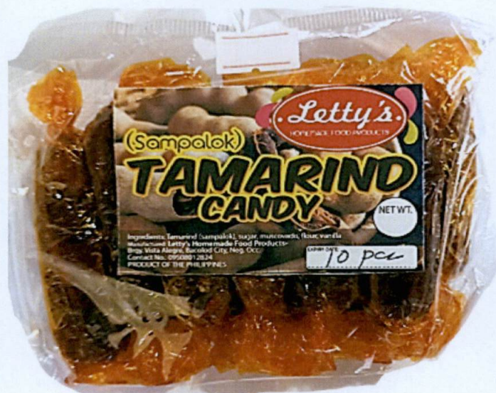
Figure 1. Unregistered LETTY'S HOMEMADE FOOD PRODUCTS Sampalok - Tamarind Candy

The Food and Drug Administration (FDA) warns all healthcare professionals and the general public NOT TO PURCHASE AND CONSUME the unregistered food product: