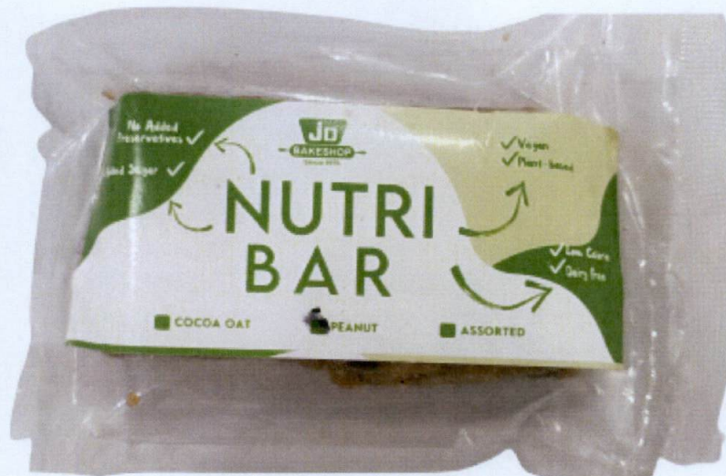
Figure 1. Unregistered JD BAKESHOP Nutri Bar - Peanut

The Food and Drug Administration (FDA) warns all healthcare professionals and the general public NOT TO PURCHASE AND CONSUME the unregistered food product: