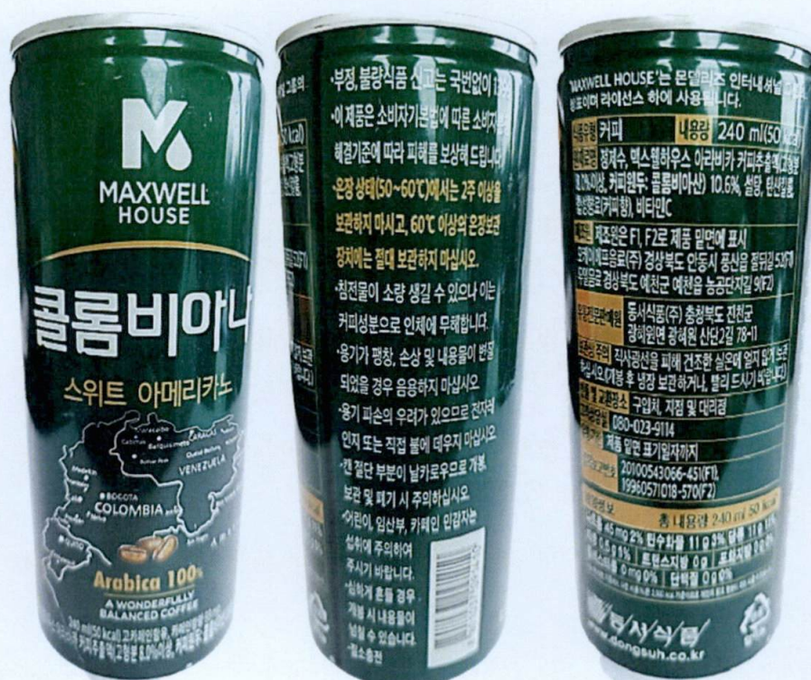
Figure 1. Unregistered MAXWELL HOUSE (In foreign language) Arabica 100%

The Food and Drug Administration (FDA) warns all healthcare professionals and the general public NOT TO PURCHASE AND CONSUME the unregistered food product: