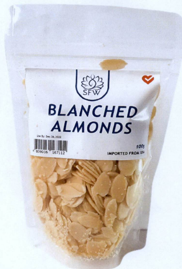
Figure 1. Unregistered SFW Blanched Almonds

The Food and Drug Administration (FDA) warns all healthcare professionals and the general public NOT TO PURCHASE AND CONSUME the unregistered food product: