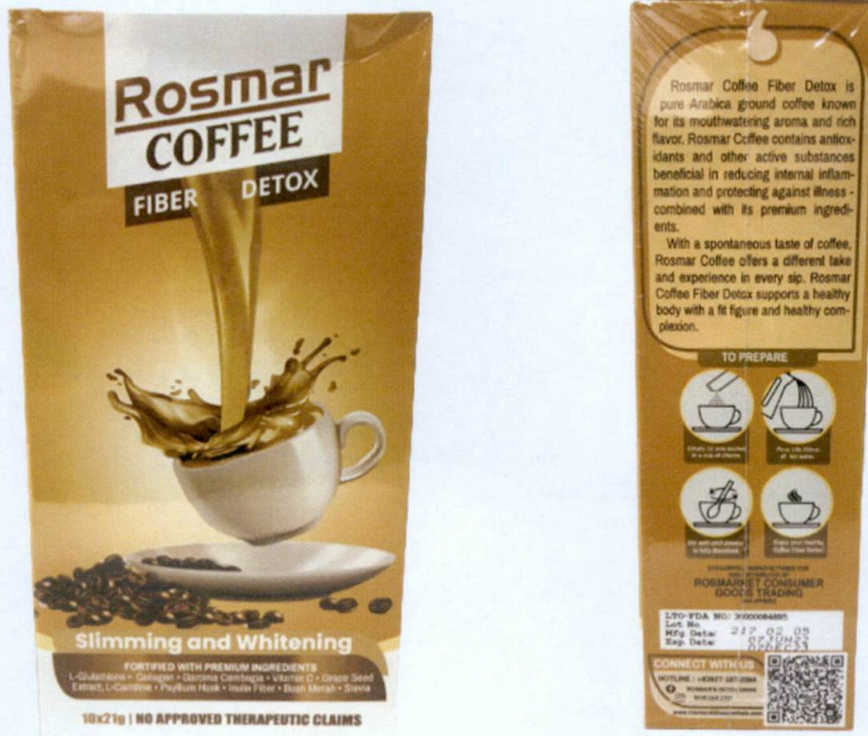
Figure 1. Unregistered ROSMAR Coffee Fiber Detox

The Food and Drug Administration (FDA) warns all healthcare professionals and the general public NOT TO PURCHASE AND CONSUME the unregistered food product: