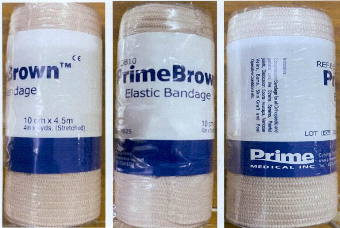
Figure 1. Unnotified Prime Brown™ Elastic Bandage Ref.BB10

The Food and Drug Administration (FDA) warns all healthcare professionals and the general public NOT TO PURCHASE AND USE the unnotified medical device product: