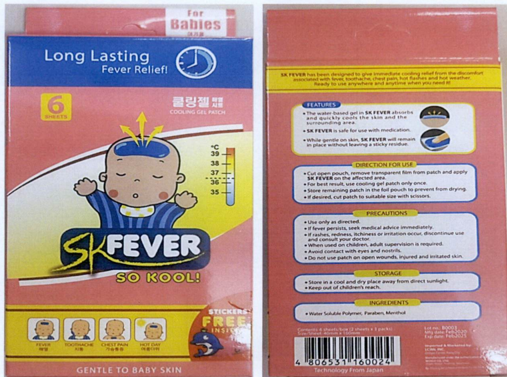
Figure 1. Unnotified SK Fever So Kool

The Food and Drug Administration (FDA) warns all healthcare professionals and the general public NOT TO PURCHASE AND USE the unnotified medical device product: