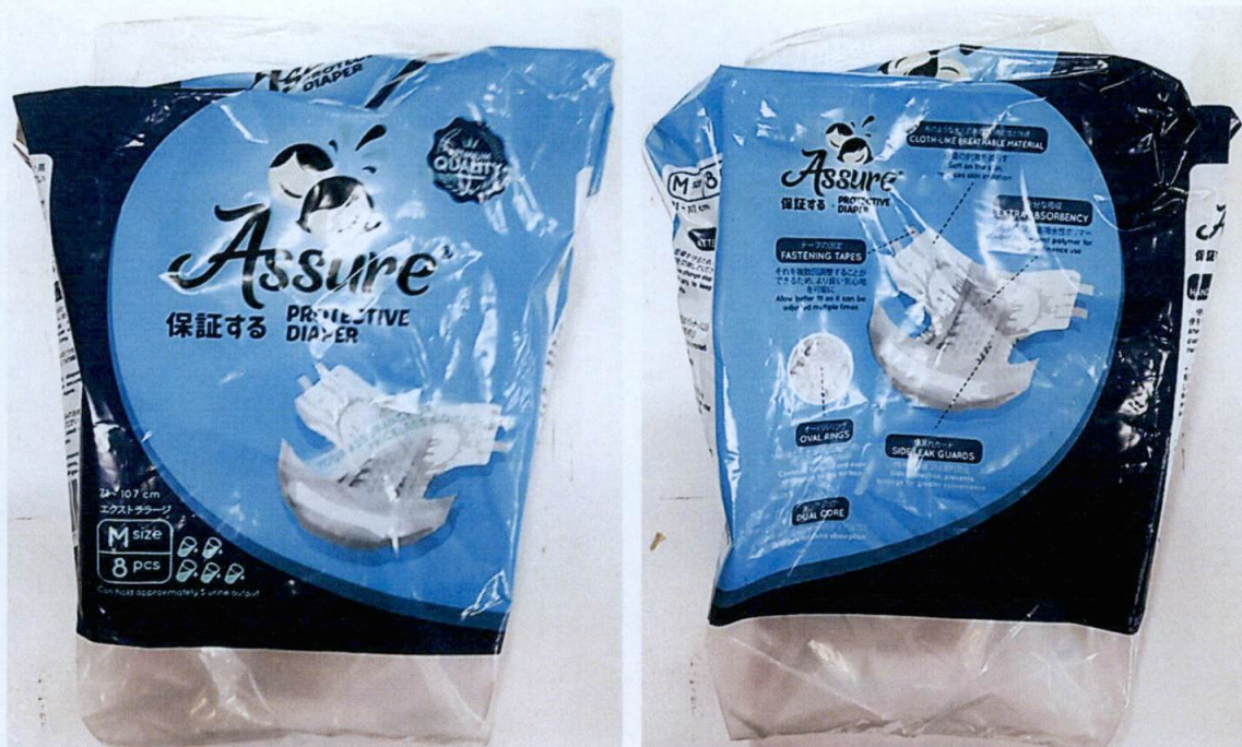
Figure 1. Unnotified Assure® Protective Diaper

The Food and Drug Administration (FDA) warns all healthcare professionals and the general public NOT TO PURCHASE AND USE the unnotified medical device product: