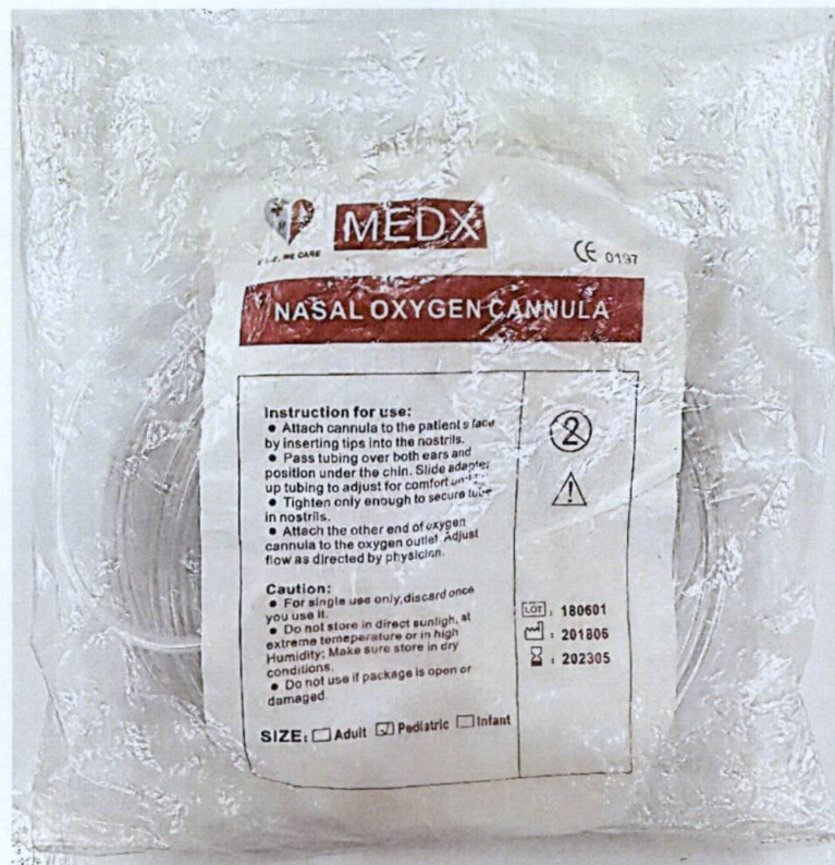
Figure 1. Unregistered MEDX Nasal Oxygen Cannula (Size: Pediatric)

The Food and Drug Administration (FDA) warns all healthcare professionals and the general public NOT TO PURCHASE AND USE the unregistered medical device product: